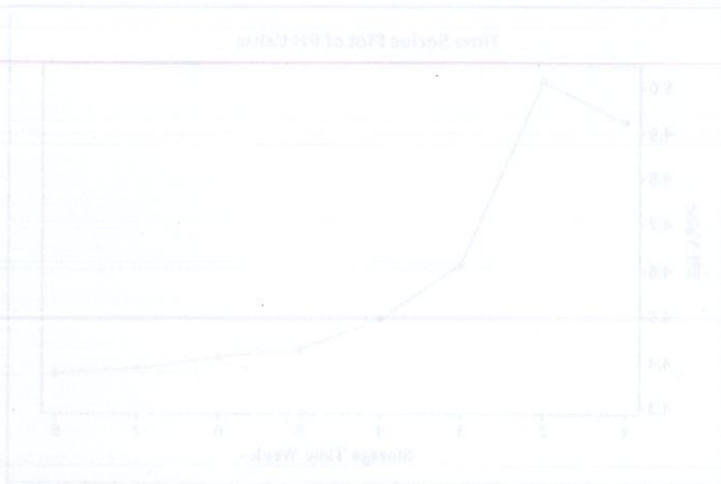
Figure 2: Changes in pH of reconstituted herbal tea sample with the storage time

The shaded cells are indicating that differences of average ranked higher values comparing with critical Conover-Inman value (0.002), therefore, treatment combination T2 is significantly different in Color, Aroma, Taste, Mouthfeel, Overall Acceptability of Herbal.